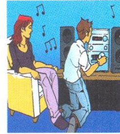
3 My parents .....!