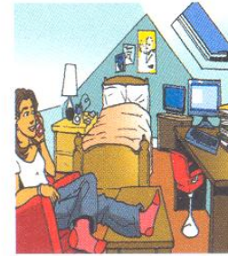
6 Ellie .....