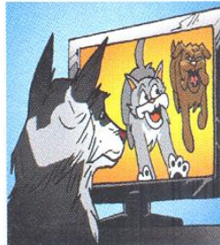
2 Look! Our dog Max .....!