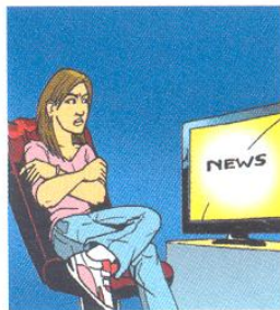
4 I .....