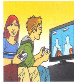
5 It's a great game, and we .....